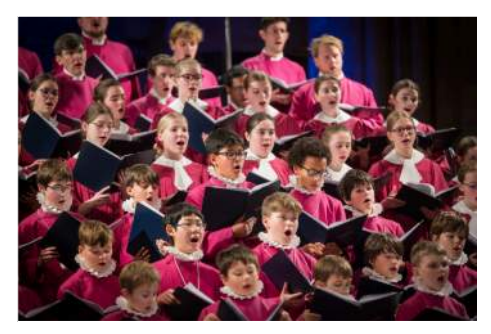
Norwich Cathedral Choir

Doors: 5.45pm. Tickets £15-£40. Tickets on sale from January 2025