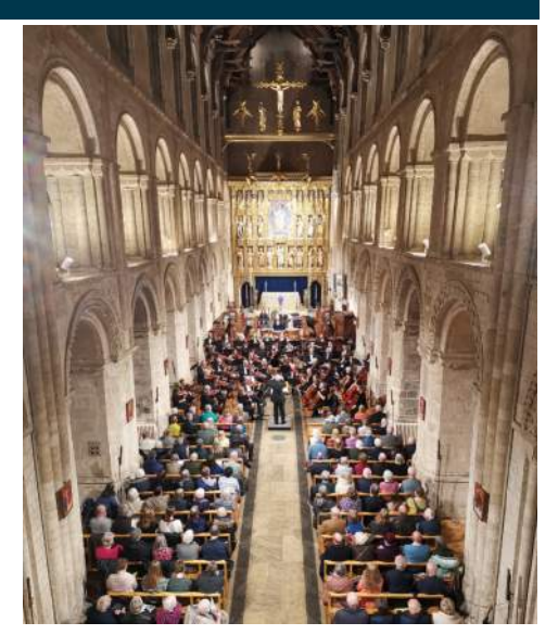
Tickets for concerts are bookable at https://www.trybooking.com/uk/eventlist/wso £15 for an adult, under 18s are free. Ely concert info at https://elychoralsociety.org/