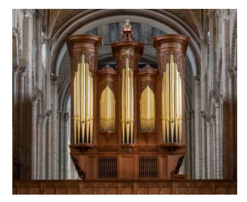
Norwich Cathedral organ which has been recently refurbished

For details of 2025 organ recitals, please visit www.cathedral.org.uk