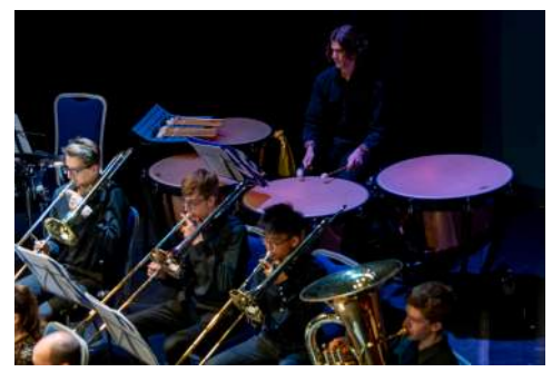
Norfolk County Youth Orchestra

Norfolk County Youth Orchestra (NCYO), part of Guildhall Young Artists, was founded in 1959 to provide gifted young musicians from across Norfolk the opportunity to develop their skills and gain performing experience. The orchestra welcomes up to 85 members from age 11–18 and is joined by our exciting new ensemble NCYO Springboard.