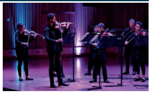
Britten Sinfonia

Britten Sinfonia is a different kind of orchestra – defined not by the traditional figurehead of a principal conductor, but by the dynamic and democratic meeting of its outstanding individual players and the broad range of their collaborators.