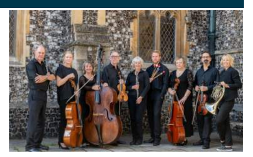
Academy of St Thomas 2019

The Academy of St Thomas was founded in 1973 and has been promoting high-calibre concerts in the region ever since.